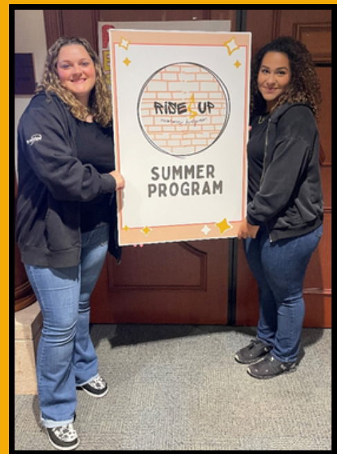
Juvenile Division Interns