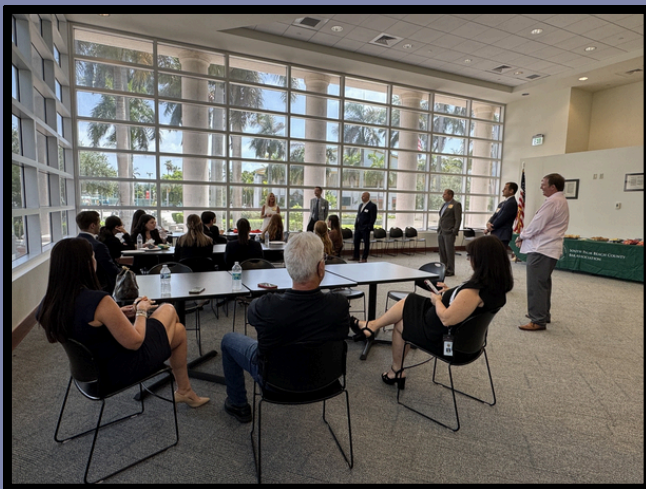
On July 25, the South Palm Beach County Bar Association hosted the summer interns and law clerks for a luncheon at the South County Courthouse in Delray Beach.

The interns and law clerks were able to hear from SPBCBA Board members as well as judges, learning about their career paths and gaining valuable advice.