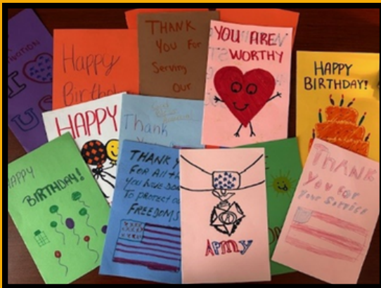
Kids Kards for Veterans