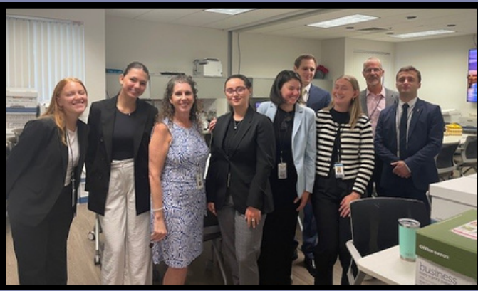
On July 17, the summer interns visited the Palm Beach County Medical Examiner's Office. During their visit, they had the opportunity to attend the morning briefing and learn more about the role of the Medical Examiner.