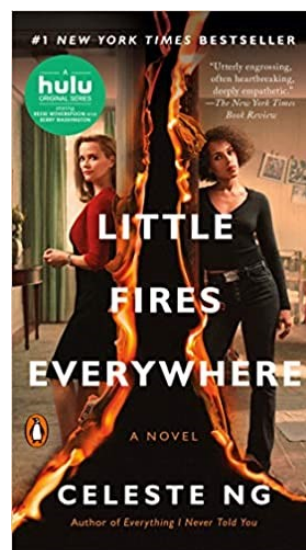
Cover of Little Fires Everywhere

The Circuit Book Club is currently on hiatus. Stay tuned for updates.