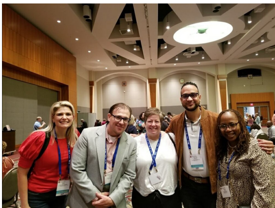
Court Administration at NACM