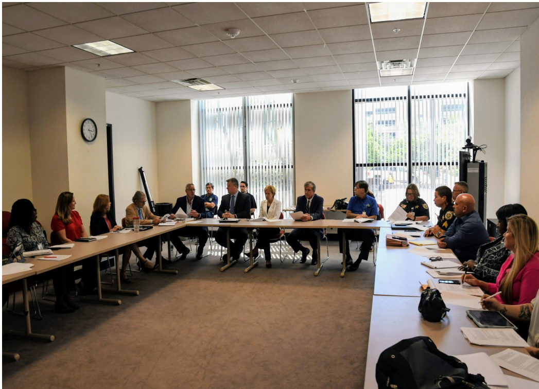
Officials attend meeting about buildout