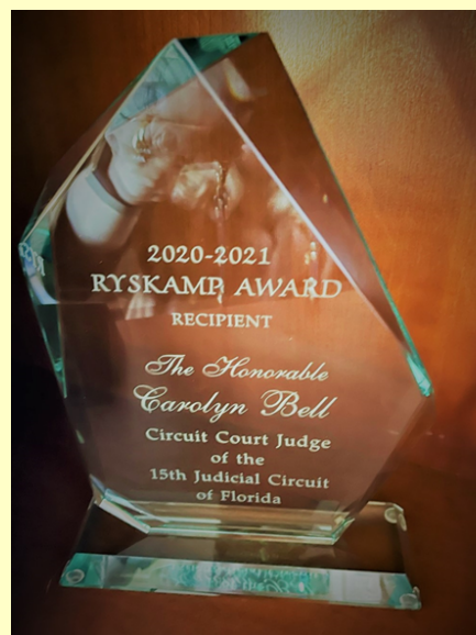
Above: The Ryskamp Award

The Fifteenth Judicial Circuit congratulates Judge Bell on this significant recognition.