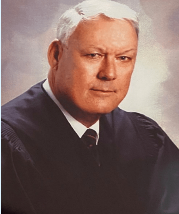
Hon. Walter N. Colbath, Jr.

Judge Colbath was passionate about public service and politics, beginning his legal career as the Public Defender of the Fifteenth Circuit in 1966. He left the Public Defender's office in 1972, and later successfully ran for Councilman, then Mayor of the Village of North Palm Beach.