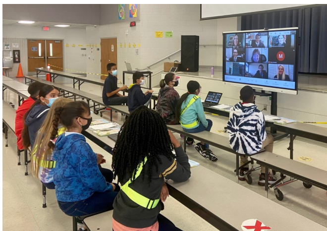
Students participating in the Reading & Robes event