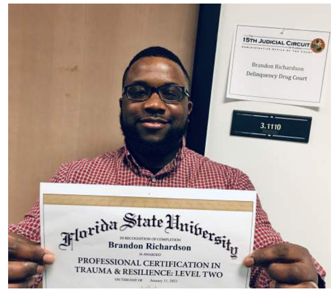
Feb - Mar 2021 Page 5