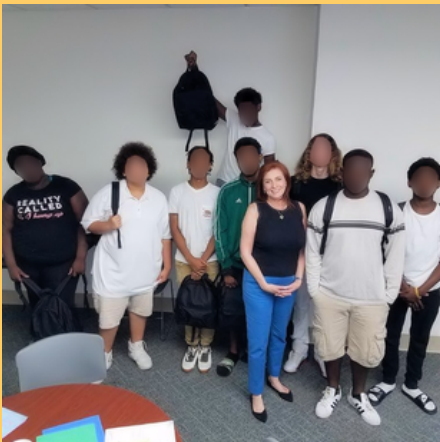
Right: West Palm Beach Police Department and participants

Ten youth completed the program, four of whom were successfully terminated from Probation. Entities that partnered with the program included: law enforcement, FAU, Department of Juvenile Justice, FAWL, PBC Fire Rescue, PBC Department of Victim Services, CareerSource, PBC Library, Delray Beach Parks and Recreation, X102.3, PBC School District, South Palm Beach County Bar Association and Sal's Ristorante. Each week, the group earned community service through the creation of greetings cards for veterans; nearly 700 cards service were completed and delivered to the VA Hospital in West Palm Beach. The programming concluded with a Back to School Bash where youth were provided with a brand-new backpack with school supplies.