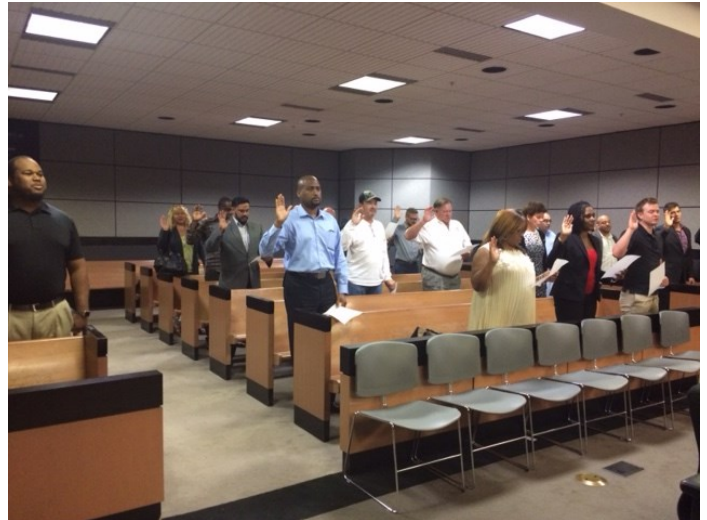
Process Servers being sworn in.

For more information on Certified Process Servers go to: www.15thcircuit.com/processservers .