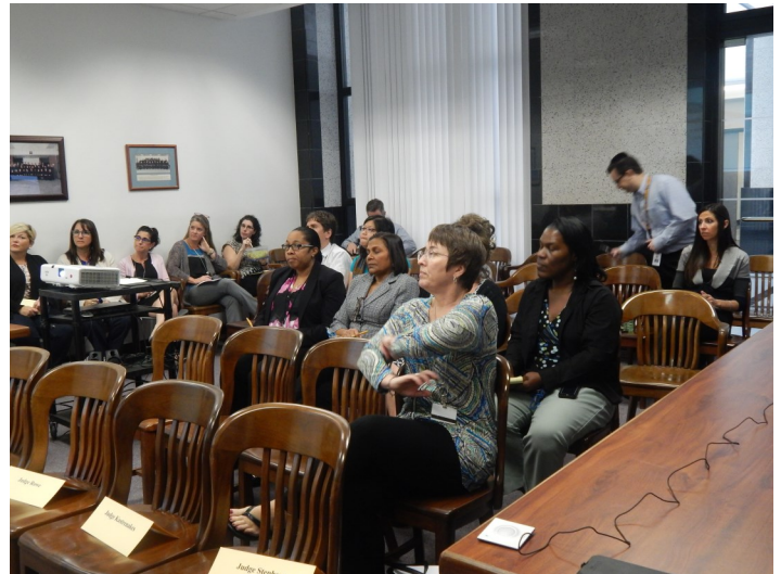
Lunch-n-Learn participants learn about the Judicial Viewer System.