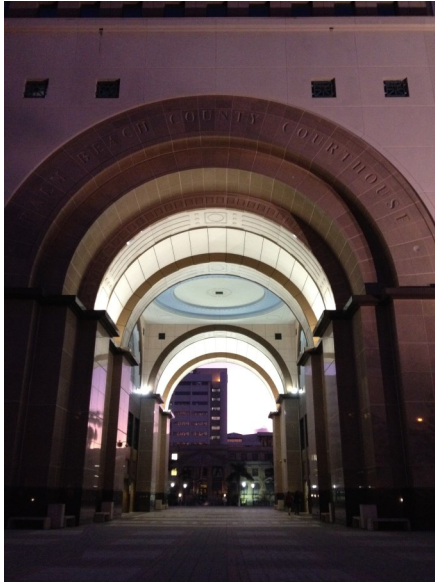
Cover Photo: Deputy LaFlamme