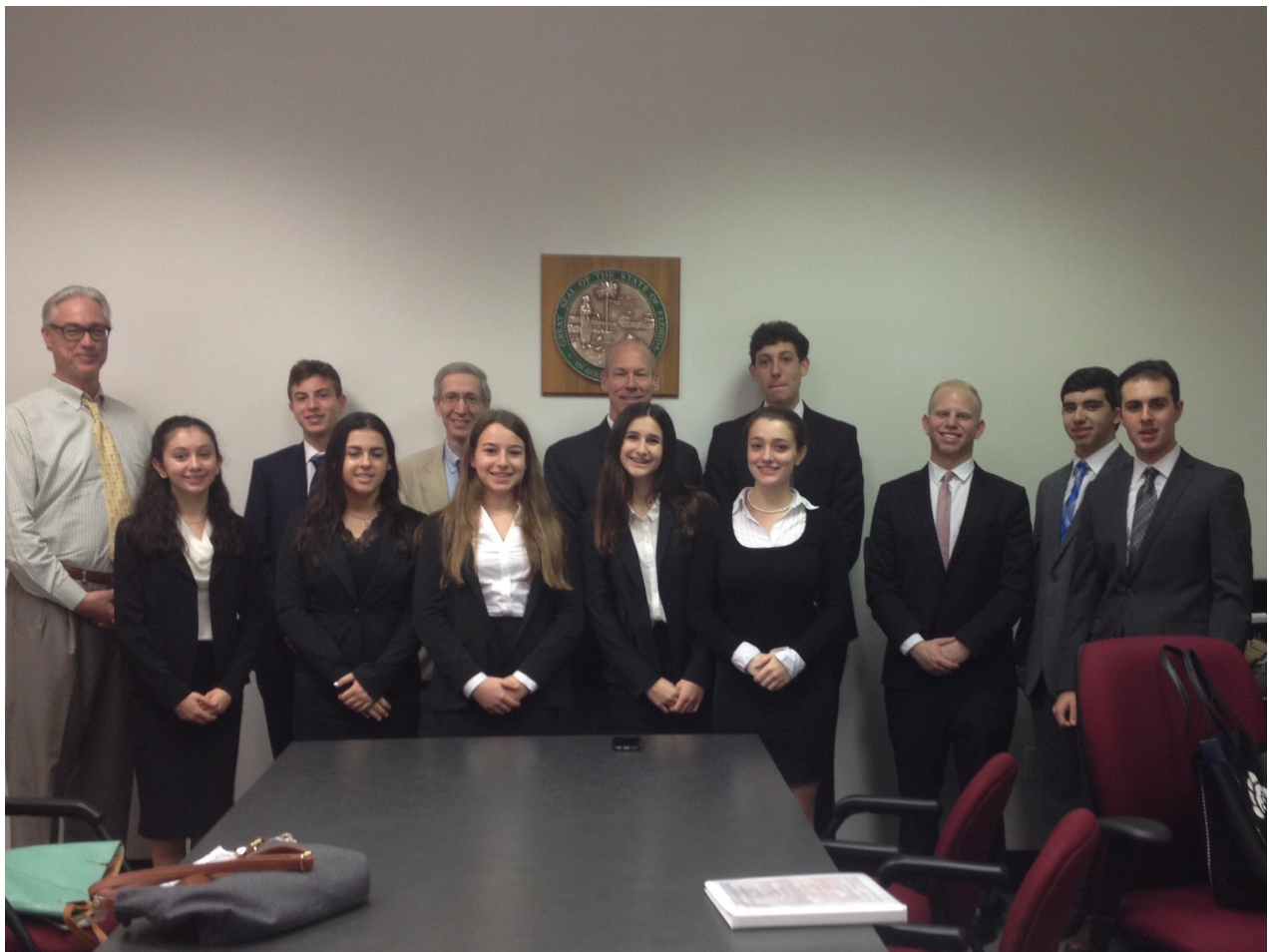
PBC Mock Trial Competition participants at the Main Judicial Complex.