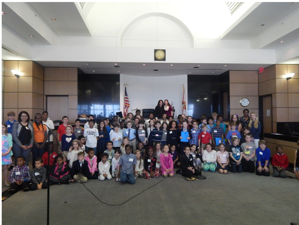
2017 Take Your Child to Work Day Participants