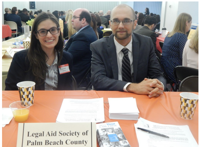
Legal Aid Society.