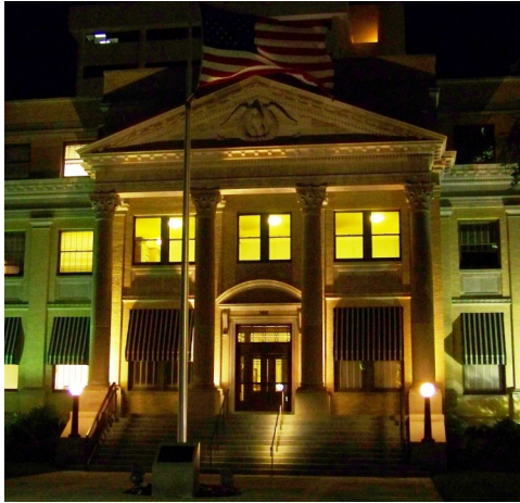
Cover Photo: Deputy LaFlamme