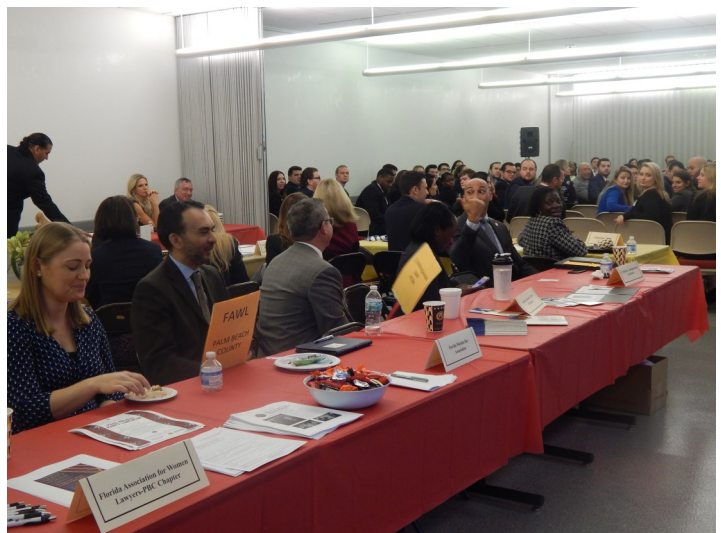
Various local bar associations wait to talk with new attorneys.