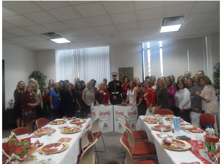
PBCJAA Holiday Party