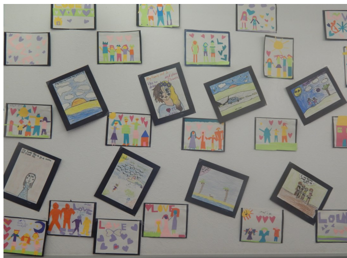
Adoption Day Cards.