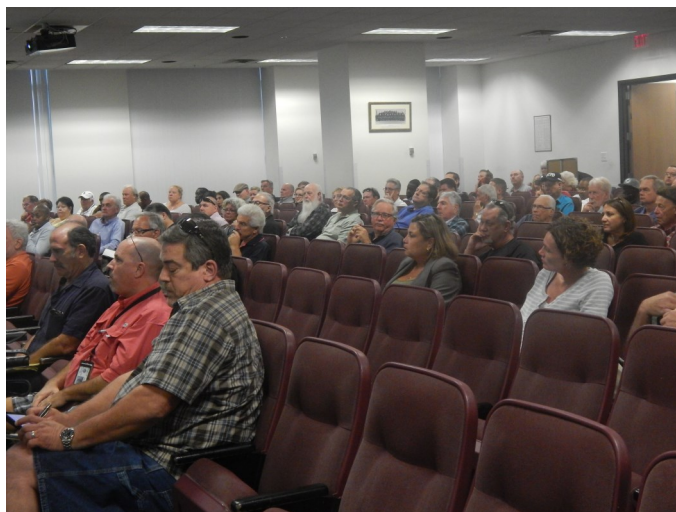
Process Servers Training.

For more information on Certified Process Servers go to: www.15circuit.com/processservers.com