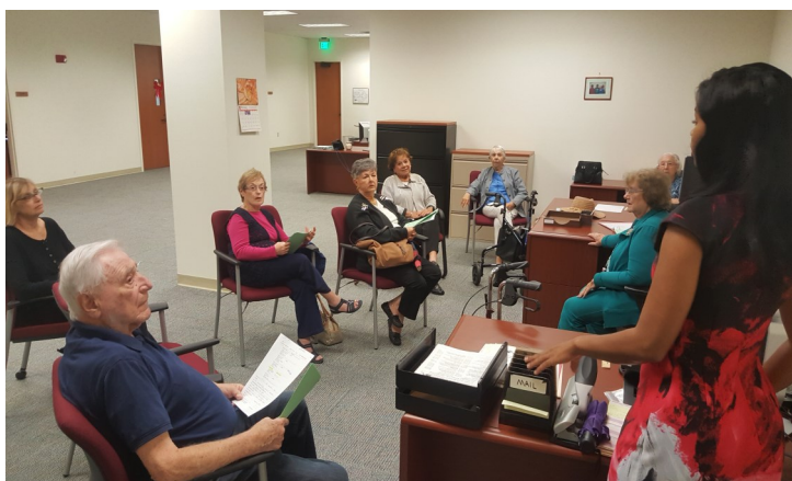
Potential volunteers gather at the South County Courthouse for an information session.