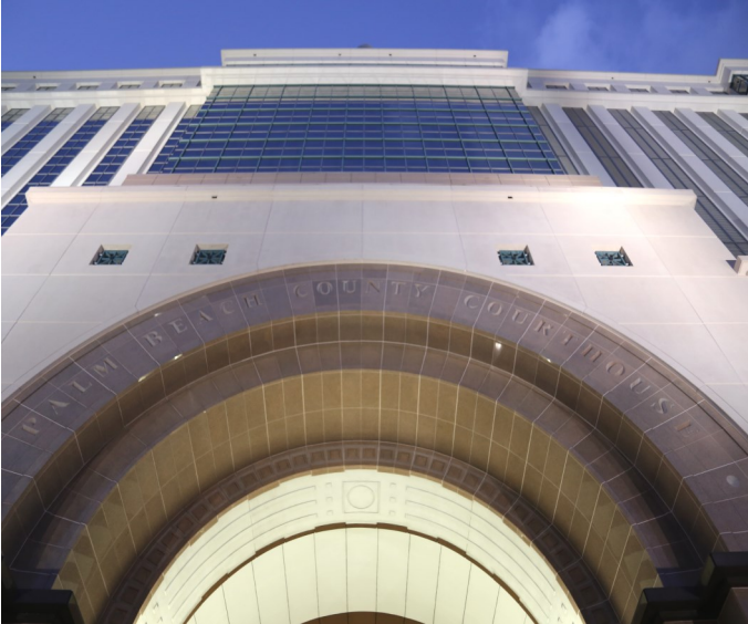
On the Cover: Main Judicial Center