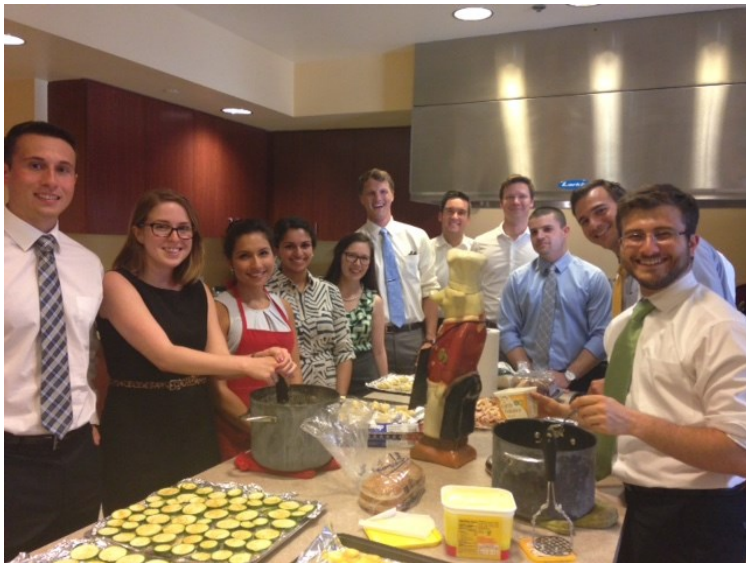
Summer Interns and Staff Attorneys from the 15th Judicial Circuit Court gather to prepare dinner for families staying at the Quantum House.

In addition to lunch and learn sessions with judges, the interns and staff attorneys had a lunch and learn with local civil practitioners to learn more about the areas of commercial litigation, personal injury litigation, probate litigation, family law, and land use. The final lunch and learn of the summer was with attorneys from other governmental agencies including the Palm Beach County Attorney's Office, Legal Aid of Palm Beach County, the Guardian Ad Litem's Office, the Delray Beach Police Department, the City of West Palm Beach, the South Florida Water Management District, and the Department of Children and Families. Applications for the 2016 summer intern program will be available in January 2016.