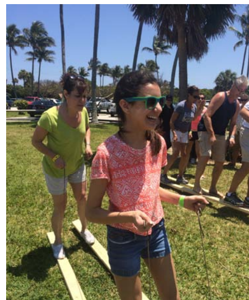
Land skiing proved to be a popular event