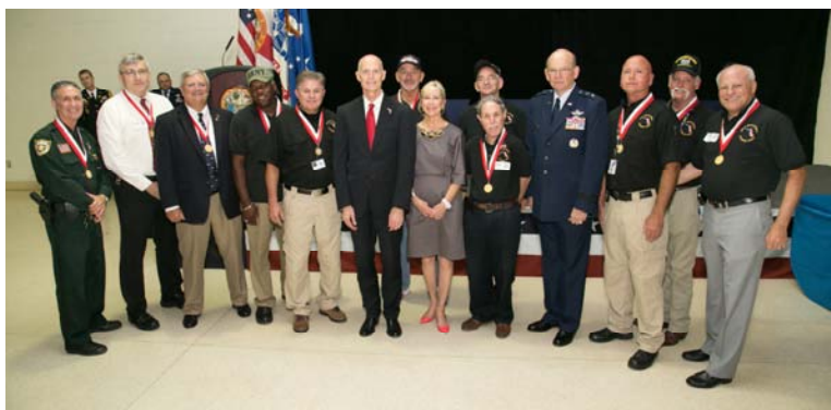
Florida Governor, Rick Scott, with the Veterans' Court Team