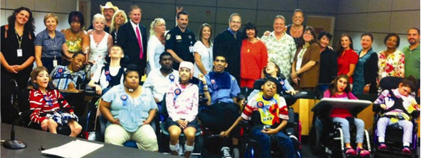
Participants of the mock trial included Judges, judicial assistants, a court deputy, court staff, teachers, parents and most of all the students.

Students from the Royal Palm School participated by acting as ‘jurors’ in a ‘case’ in which court staff acted as plaintiff, defendant, attorneys and witnesses.