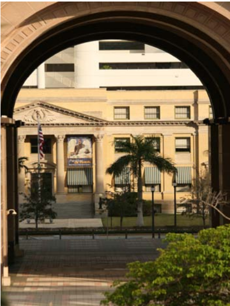
Cover: Main Judicial Center