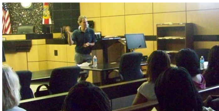
Health and Wellness