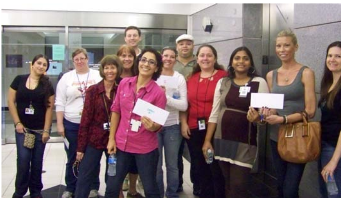
Court staff participate in "The Amazing Race"