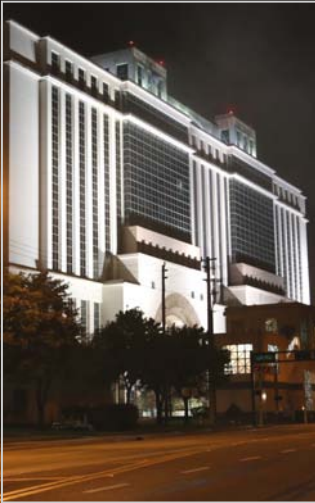
On the Cover: Courthouse, WPB