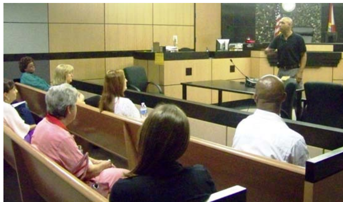
Personal Safety and Identity Theft