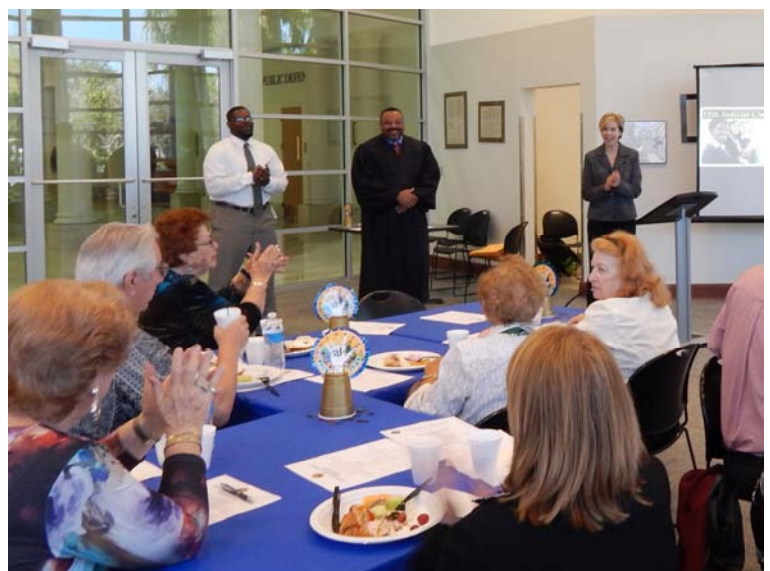
Judge Reginald Corlew thanks the volunteers for their service in the South County Courthouse.