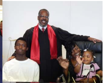
Judge Moses Baker