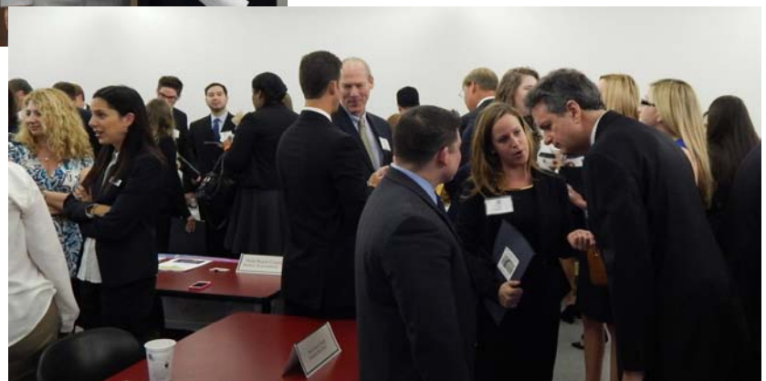
Below: Judges and new attorneys