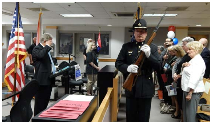
PBC Sheriff's Office Color Guard