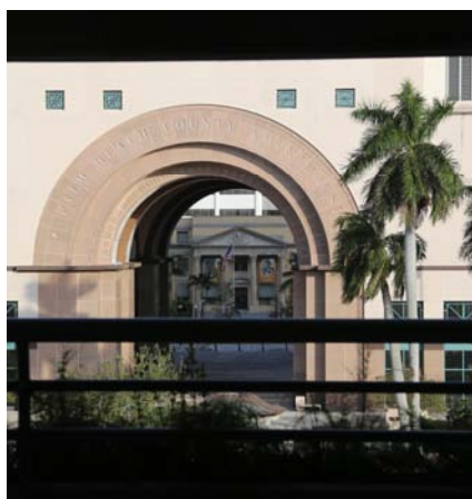
Cover photo: Main Judicial Center, WPB