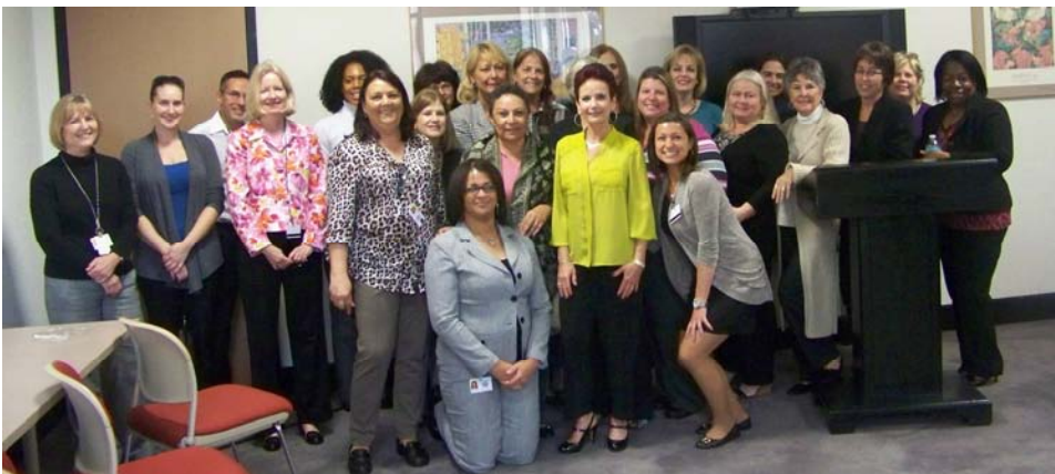
Left: Judicial assistants and court staff