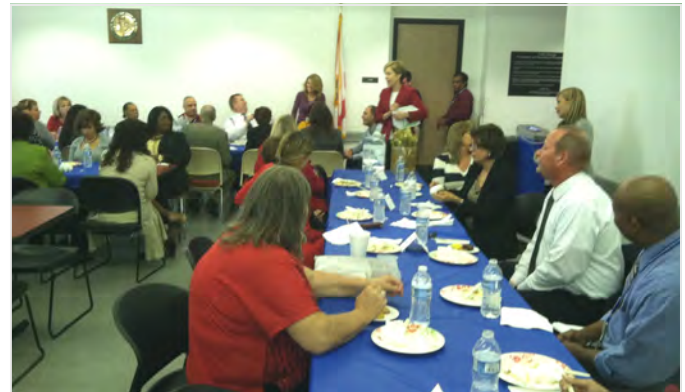
The Annual Court Administration Holiday Party was held on Thursday December 9.