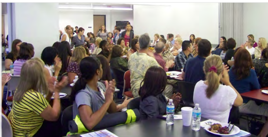
Court staff introduce themselves during the breakfast.