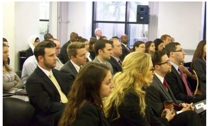
New attorneys listen to the presentation.