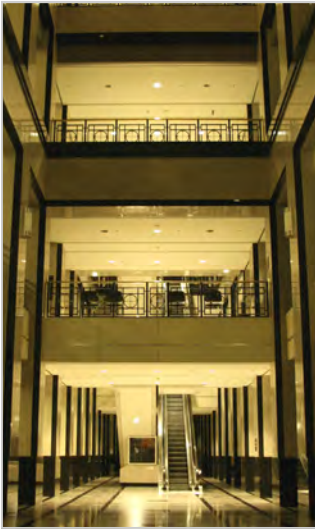
On the Cover: Courthouse, WPB