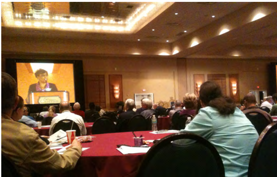
Supreme Court Justice Peggy Quince addresses the audience via video-conference.

Judges, mediators, attorneys, educators, and other professionals from every circuit gathered to discuss matters that impact the courts, including ethics issues, cultural diversity, and how ADR can best serve the court process.