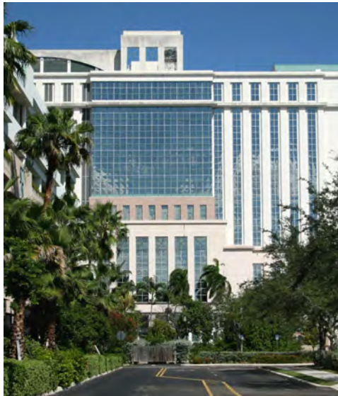
On the Cover: Main Judicial Center