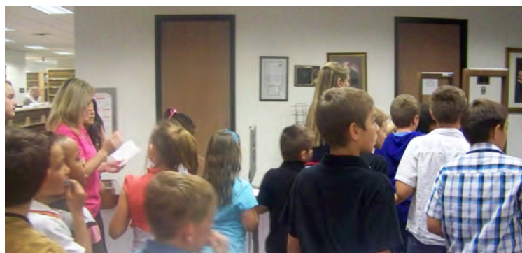
A group of children in the law library receive their next clue for the scavenger hunt after reciting the alphabet backwards.