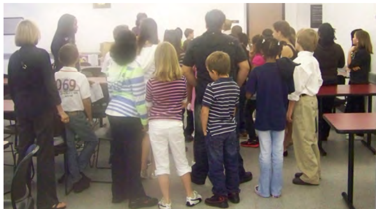
Children gather in the cafeteria to divide into groups and receive their assignments and mentors for the day.

The event is held on the last Thursday of each April to showcase career possibilities to school-age children.