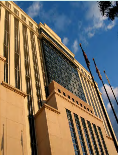
Cover: Main Judicial Center

Representatives from the Fifteenth Judicial Circuit were among fifty teams awarded a 2012 Davis Productivity Notable Team Achievement Award. A ceremony on June 20, 2012, recognized the winners for excellence, innovation and government productivity.