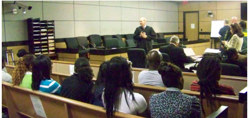
Judge Jeffrey Colbath

The Palm Beach Sheriff’s Office Court Containment Team (CCT) and K-9/Deputies provided demonstrations and answered questions.