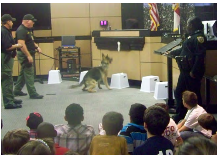
PBSO Deputies demonstrate the ability of the K-9 to detect explosive materials.