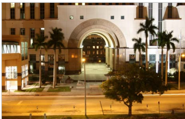
On the Cover: Courthouse, WPB