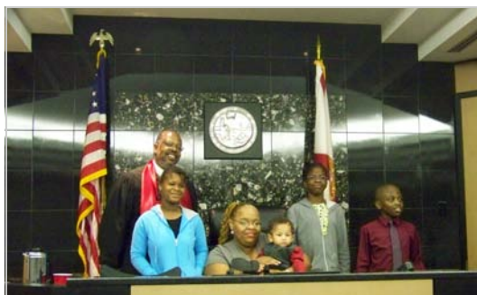
Judge Baker congratulates a family on their adoption.