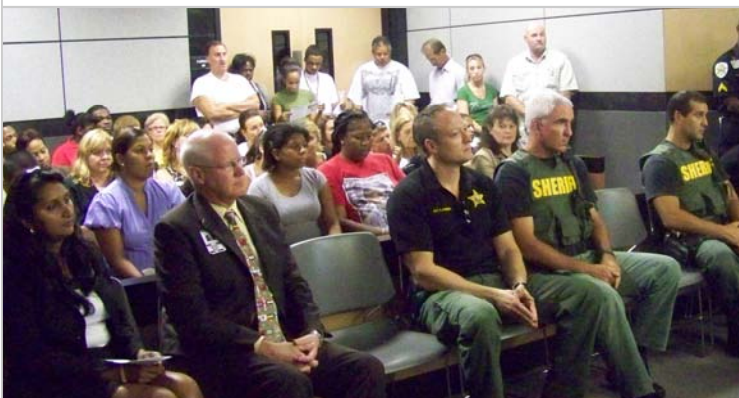
Participants and observers fill the courtroom for the third Delinquency Drug Court graduation.