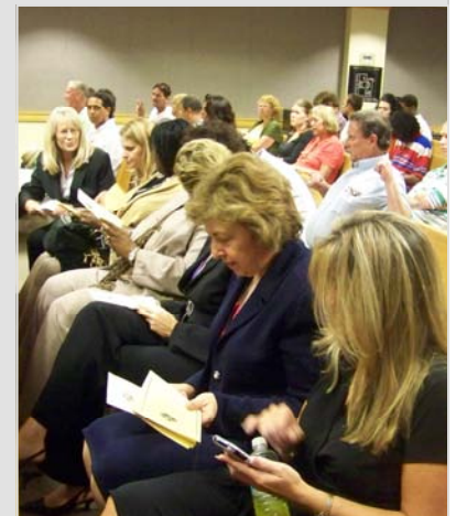
Court staff in attendance.