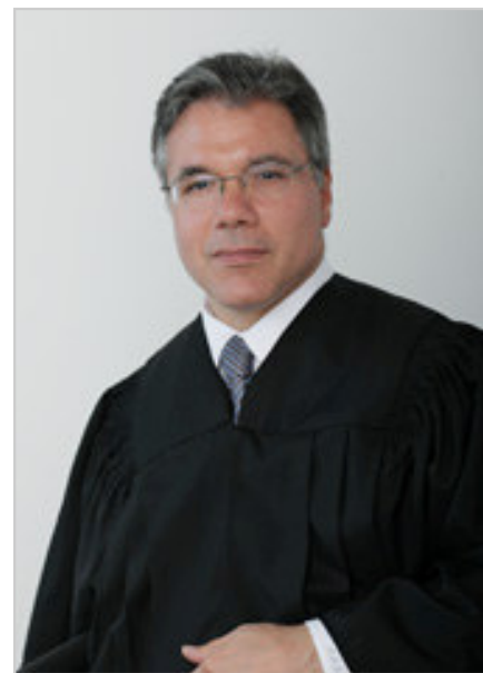
Judge August Bonavita

Judge August Bonavita will be holding the first docket on September 14, 2010. The defendant's presence is completely voluntary and no FTA (Failure to Appear) warrants will issue if the defendant does not attend. The goal is to dispose of as many cases as possible, in an effort to reduce the already overburdened case disposition docket.