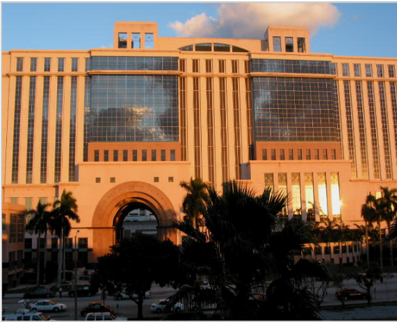
On the Cover: Main Judicial Center, WPB