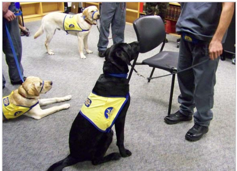
Service dogs in training demonstrate their skills for the visiting children.