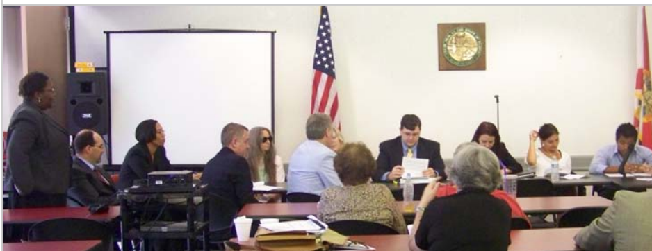
Magistrates and staff participate in a mock judicial review hearing.

Judges, magistrates, and staff attended JR training on June 3, 2010.