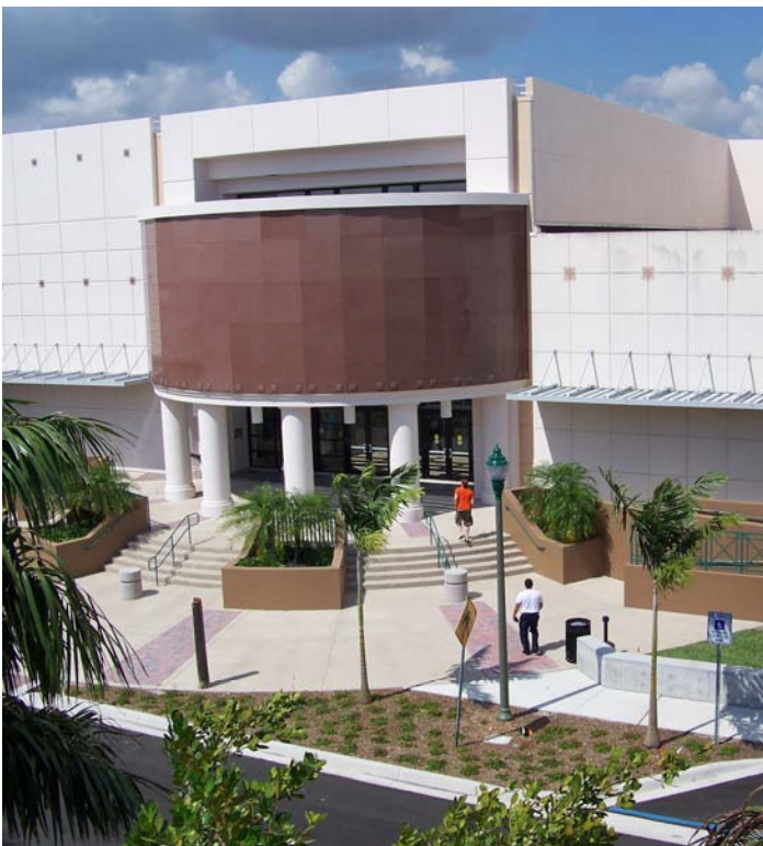
South County Courthouse entrance.