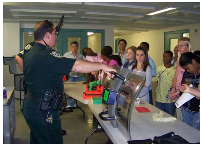
PBSO Deputies demonstrate holding cell restraints.

The children were able to visit the Evidence Room of the Clerks' Office and the holding cell in the basement of the main Judicial Center.