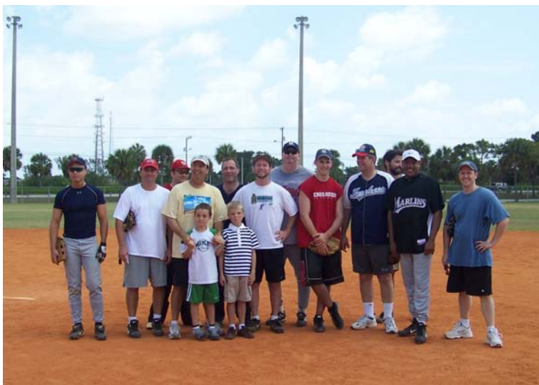
The “JUDGES” team