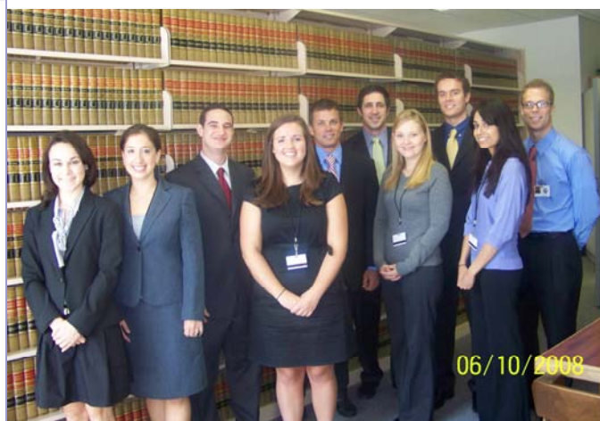
Joining the Fifteenth Circuit this summer are:

The interaction with the judiciary continues to make this a successful summer program.