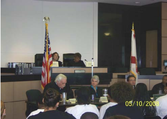
On the Cover: Judge Barry Cohen addresses the audience during the Supreme Court Justices' visit.