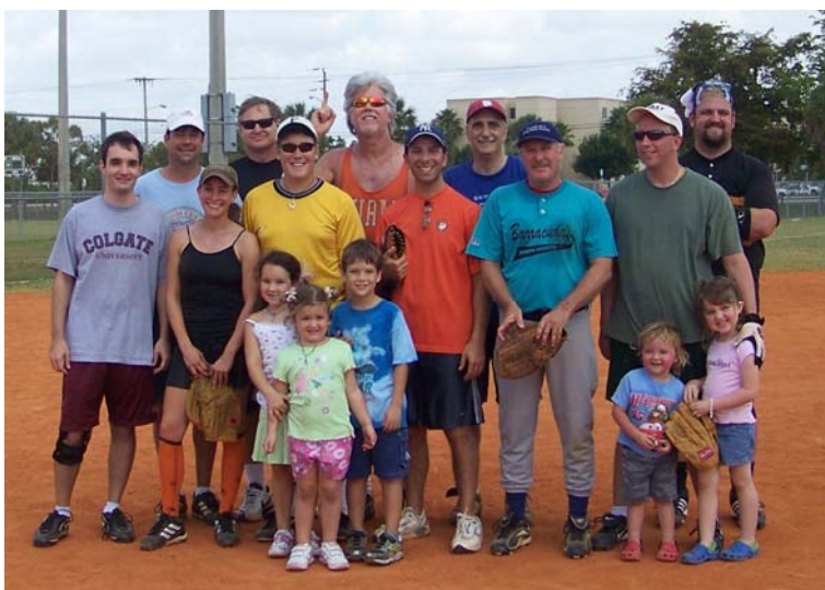
The “LAWYERS” team