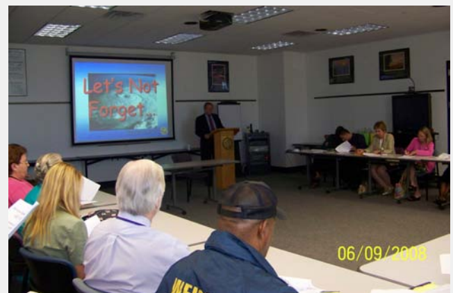
Court staff and courthouse employees watch the power point presentation.