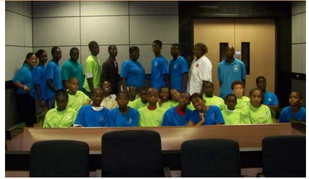
Lake Worth Youth Empowerment Group visited the Courthouse for summer tour experience

Groups wishing to arrange for a courthouse tour should call the Office of Court Education at (561)355-1537.