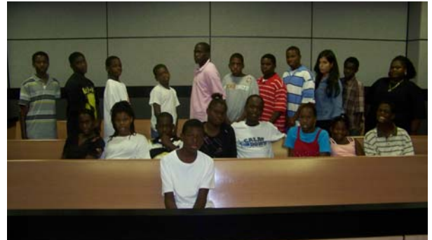
Riviera Beach Youth Empowerment Group poses for group photo prior to meeting with Judge Moses Baker.