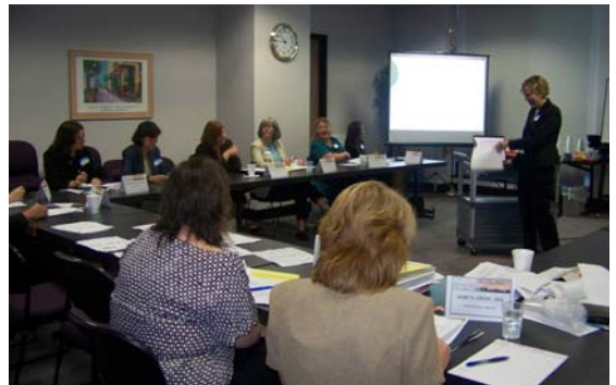
General Counsel & Senior Staff Attorneys.