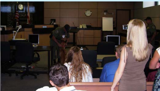
Canine demonstration at the end of a long day both informed and entertained Law Week Students, who were fascinated by the talent of both trainer and "student."

The Fifteenth Judicial Circuit collaborated with the Palm Beach County Bar Association to sponsor the annual celebration of Law Week, as promoted nationwide by the American Bar Association.