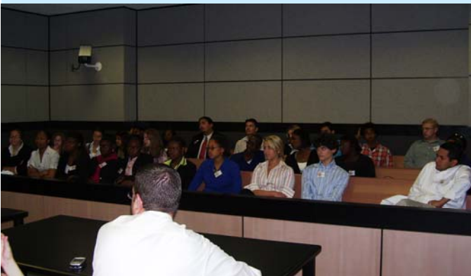
Law Week Students engage attorneys in a discussion of their roles as prosecution and defense in challenging cases.