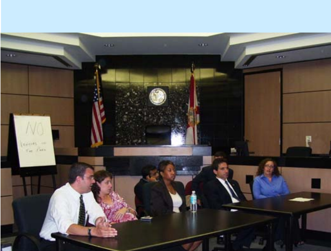
Attorneys from the Public Defender's Office and the State Attorney's Office discuss the practical implications of their roles, with Law Week students.