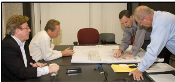
Technology and Court Reporting staff review plans

This enhancement is in compliance with the Office of the State Court Administrator's (OSCA) requirement that all digital recording systems throughout the State be capable of capturing video as well as audio in all courtrooms where this technology is provided.