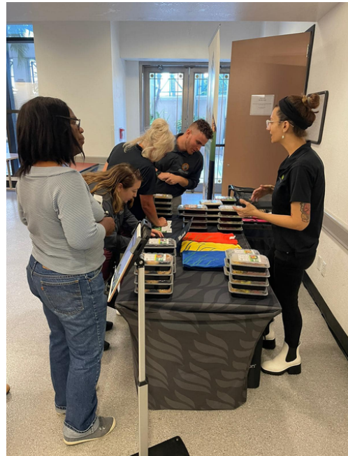
Court employees learn about meal prep offerings from Ideal Nutrition representative.