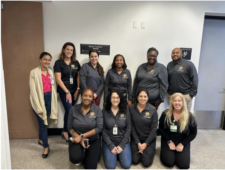
The Circuit's Health and Wellness Committee with representatives from Baptist Health.

Wellness Day was organized by the Circuit's Health and Wellness Committee as a part of the "For Your Health" program which offers monthly activities aimed at supporting and nurturing the health and wellness of the court staff and judicial officers.