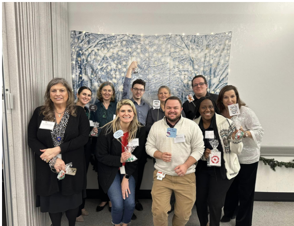
Bingo winners show off their prizes.