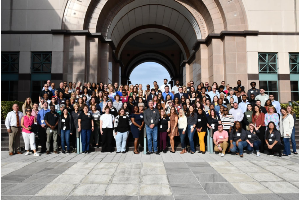
Group photo of Chief Judge Glenn Kelley with court employees during appreciation breakfast.

In recognition of the Circuit's dedicated public servants, Chief Judge Glenn Kelley proclaimed the week of October 9, 2023 "Employee Recognition Week." The week was full of events and activities for the court staff. It included an appreciation breakfast and recognition ceremony with Chief Judge Kelley as the Keynote Speaker, followed by a raffle and group photo.