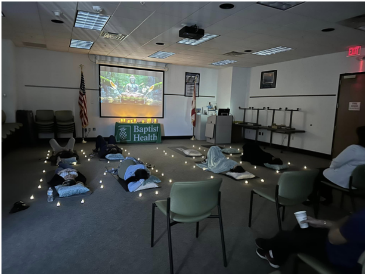
Court employees take a moment to enjoy the Zen Room.