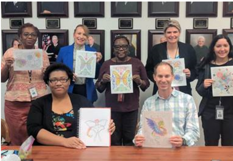
Court employees participated in adult coloring on day three of employee appreciation week.