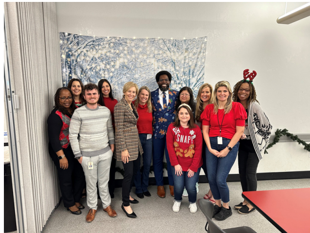
Members of the holiday luncheon committee and several court directors share their holiday cheer.