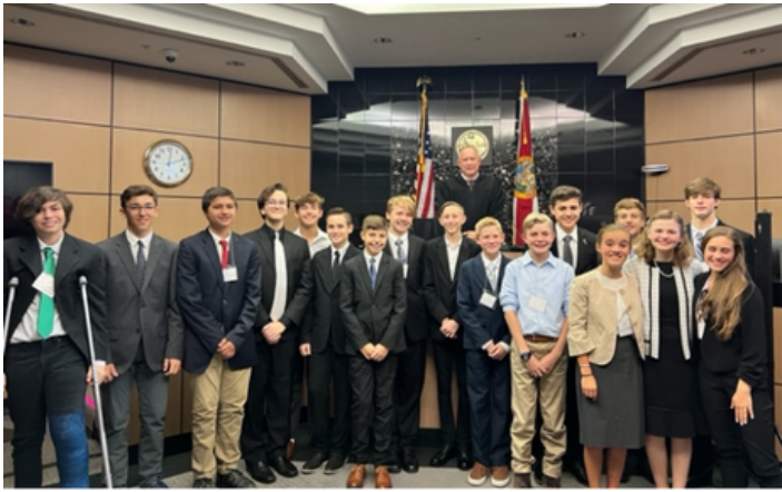
On April 21, the Honorable Darren Shall presided over a mock trial with 8th grade students from the Classical Homeschool.