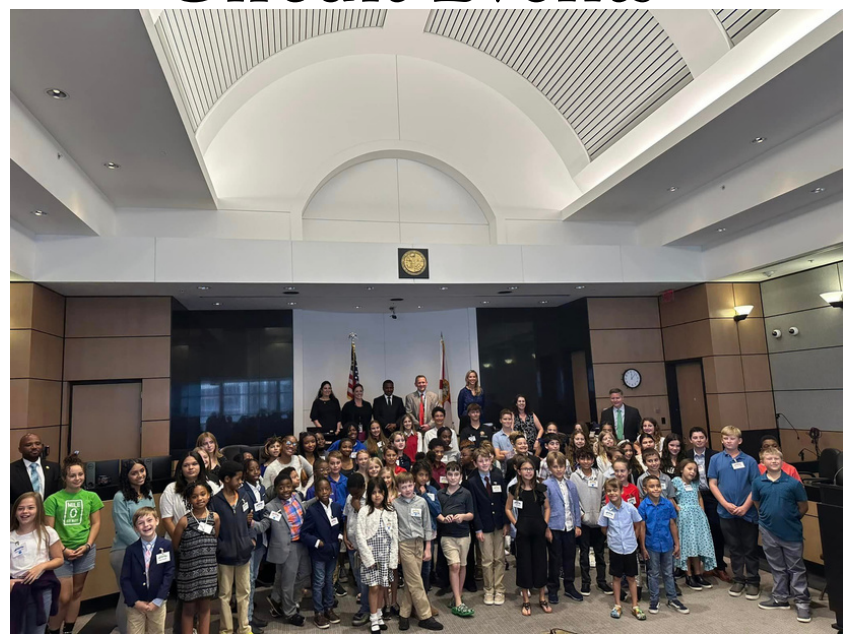
On Thursday, April 20, the Circuit welcomed the children of Circuit employees to the Main Courthouse for the annual Take Your Child to Work Day. The day included guest speakers and judges, arts and crafts, a mock trial, a K9 demonstration and tours of the Palm Beach County Historic Courthouse.