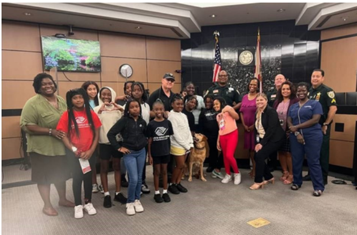
On July 20, the Hon. Cymonie Rowe welcomed a group of young ladies from the Boys & Girls Club of Palm Beach County to the main courthouse. After speaking with Judge Rowe, the students experienced a K-9 demonstration and toured the holding cell, jury room and self-service center.